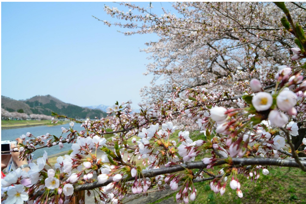
Figure 1 Kakunodate hanami