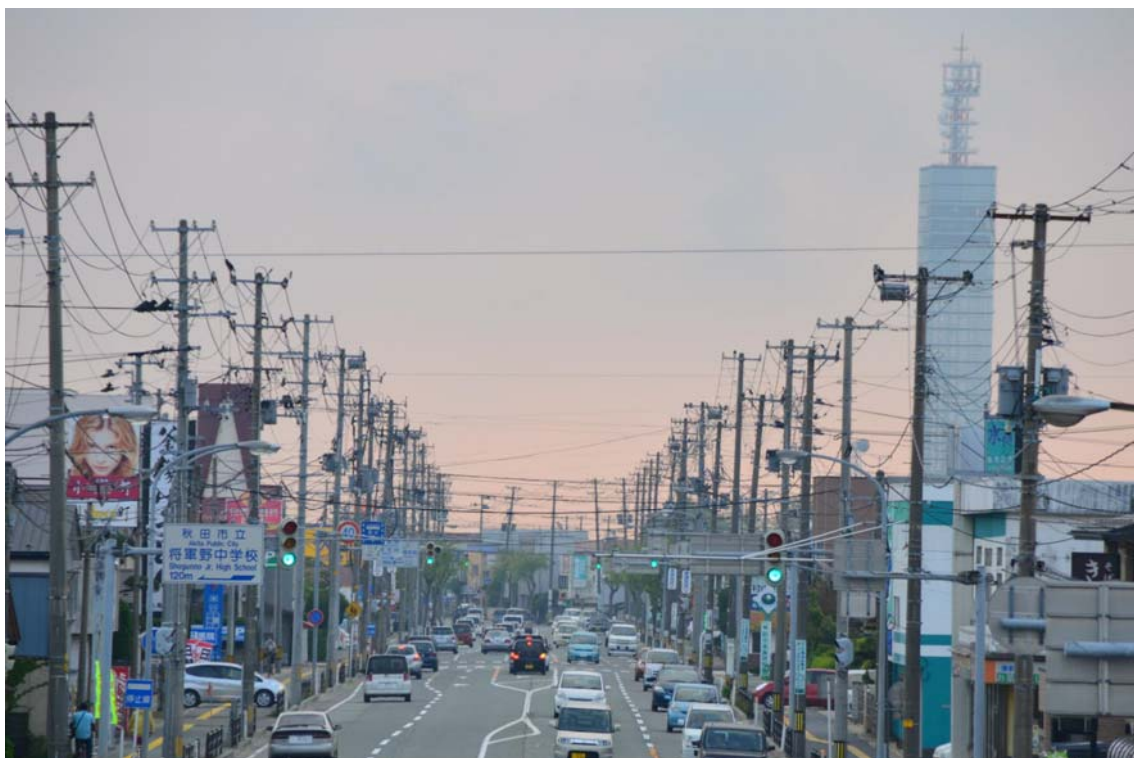
Figure 4 Road n.7 and Serion Tower