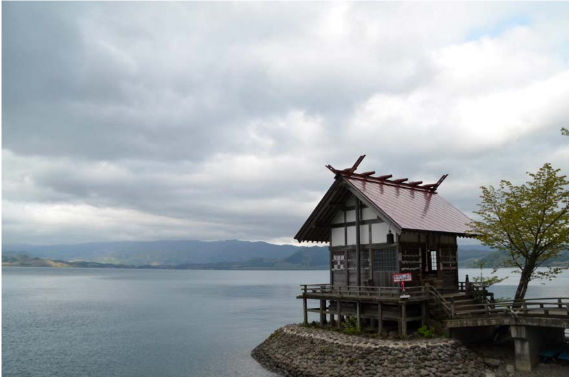
Figure 2 Lake Tazawa