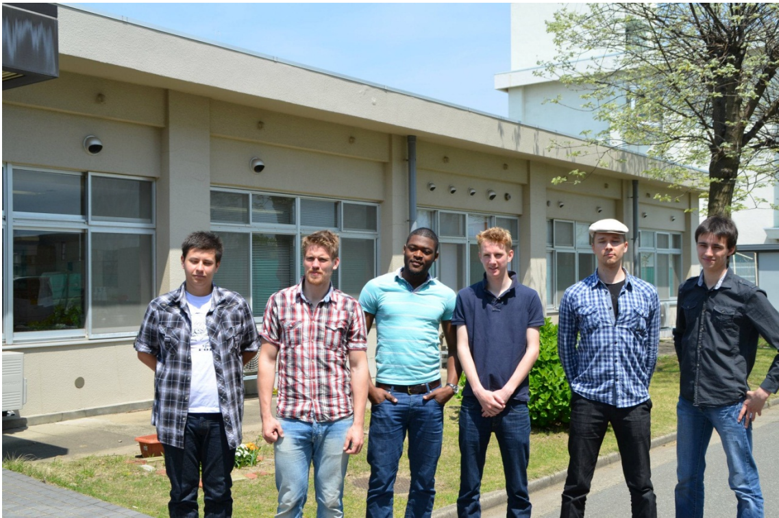
Figure 3 Work placement students